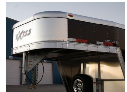
Gooseneck and Bumper Pull Models Available in Multiple Lengths