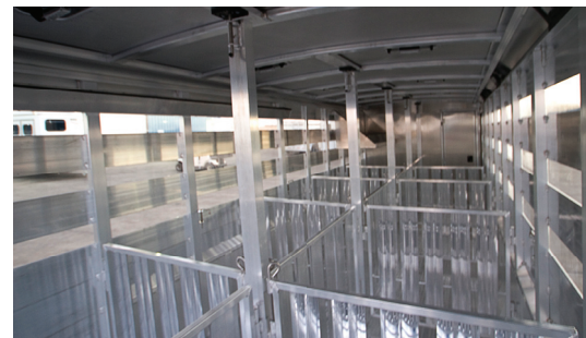
Livestock Area Features Multiple 4' Long Pens w/ Divider Gates on Each Side of Pen