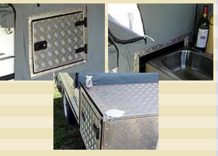
Capped Water Filler Standard with Kitchen