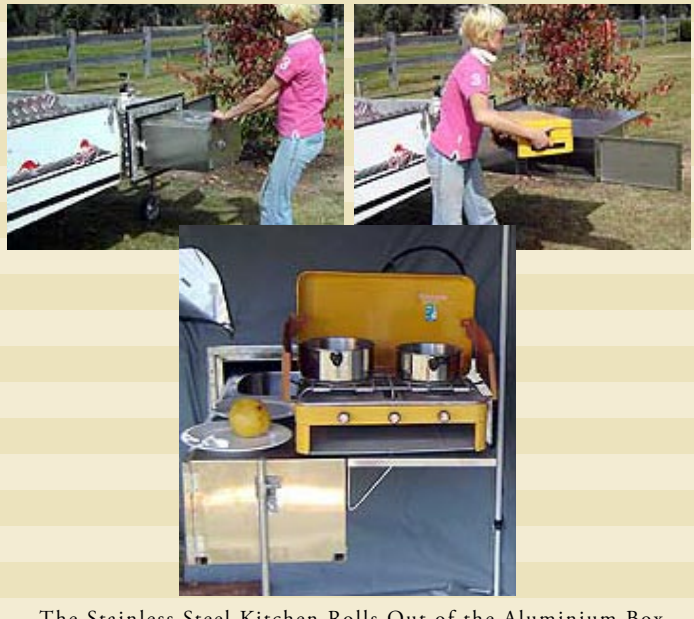
The Stainless Steel Kitchen Rolls Out of the Aluminium Box Mounted on the Drawbar.