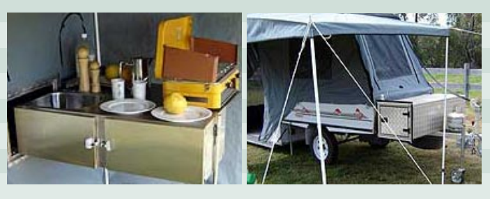
Additional awnings that cover the kitchen and provide front and side exposure protection from wind and rain are available with the optional Kitchen/onboard water.