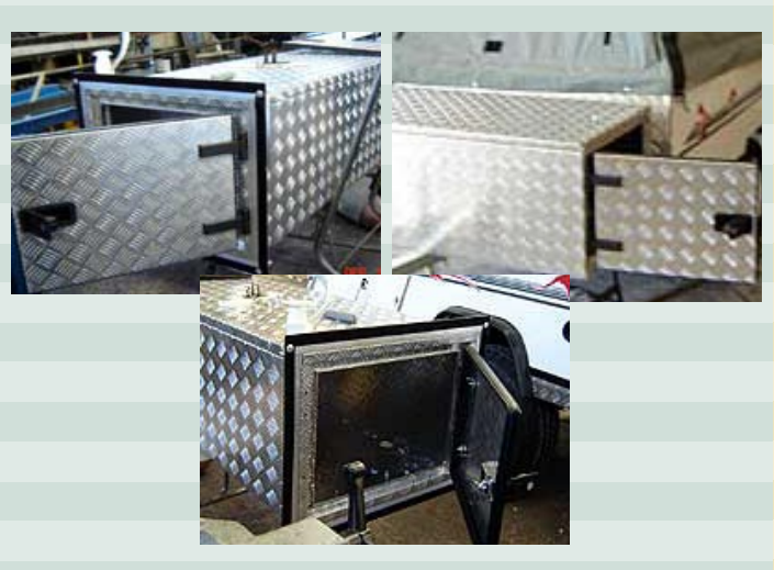
Access to Kitchen and Storage Areas from Both Sides