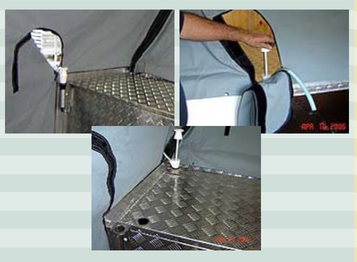
The Kitchen with a 16 Gallon Water Tank with Hand Pump