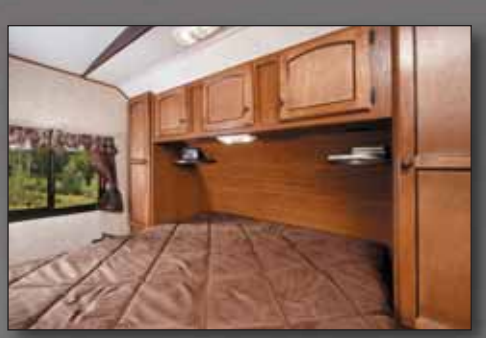
ST26BH Bedroom with corner shelves and double wardrobe