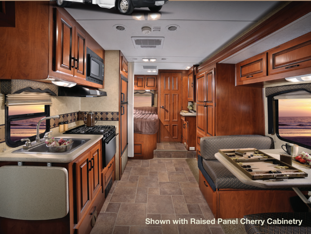
Shown with Raised Panel Cherry Cabinetry