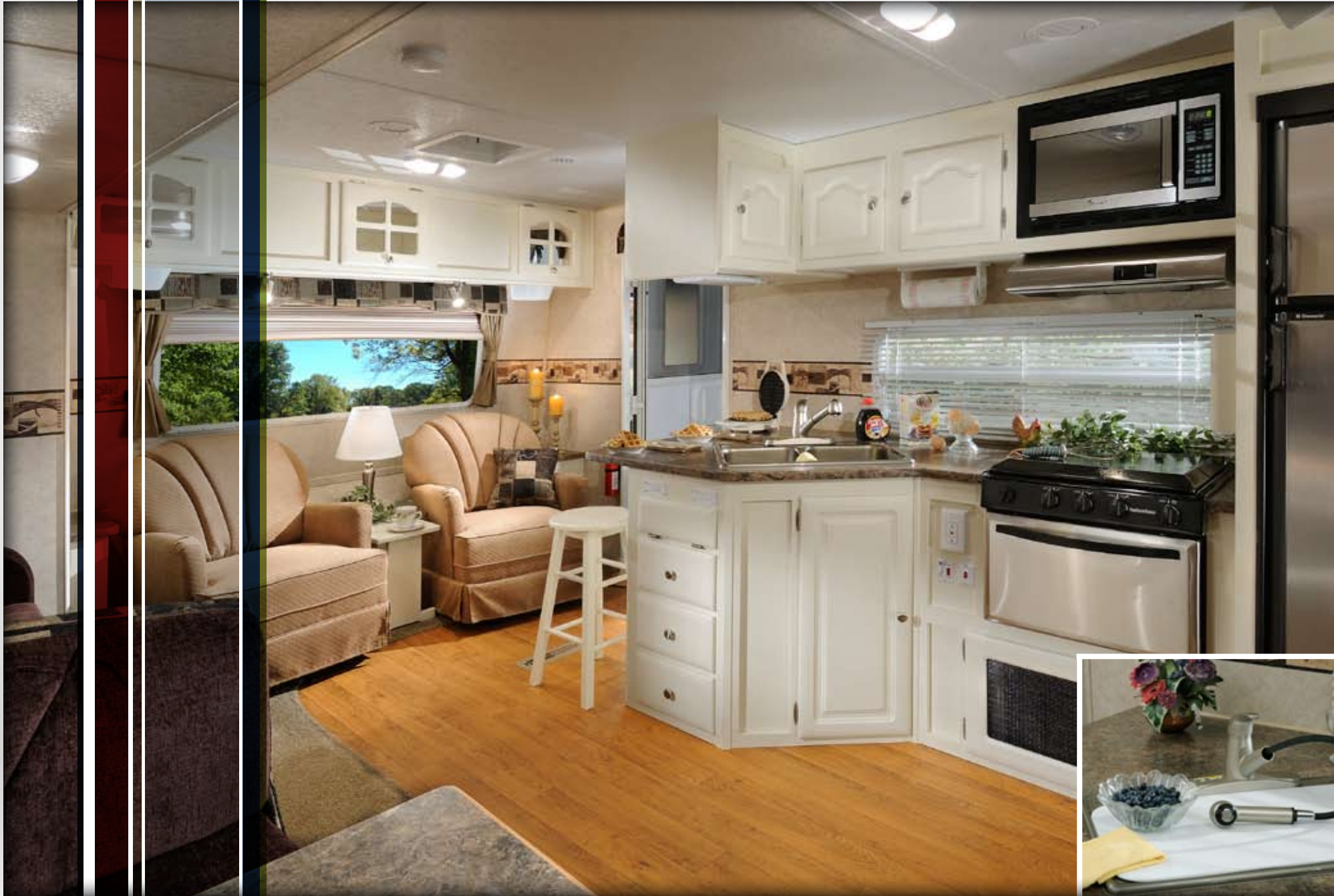
ROCKWOOD SIGNATURE ULTRA LITE · MODEL 8319SS