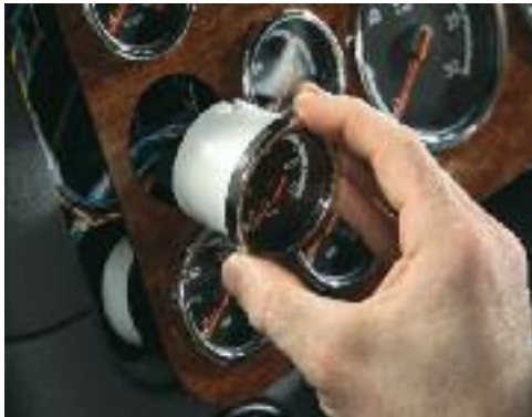
Remove and replace gauges with ease.