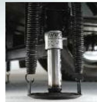
Hydraulic leveling jacks. Four fully-automatic leveling jacks are standard on all Grand Sport GTs