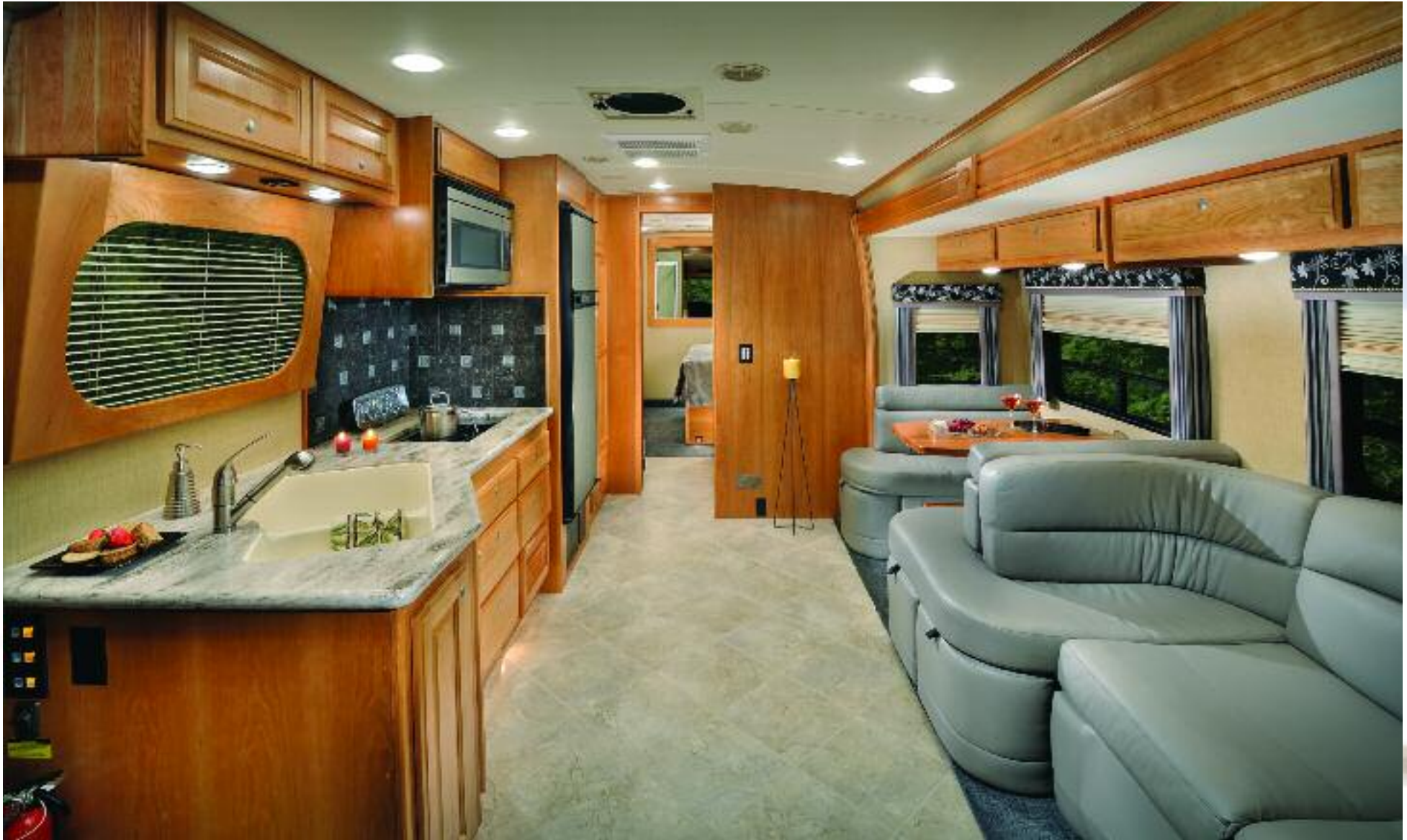
Model 371 is shown with Natural Cherry cabinetry and ceramic tile flooring in a diagonal pattern, in our classic Slate Gray decor. An ultra leather ensemble creates a versatile living space with plenty of room for everyone.