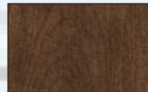
Early American Cherry