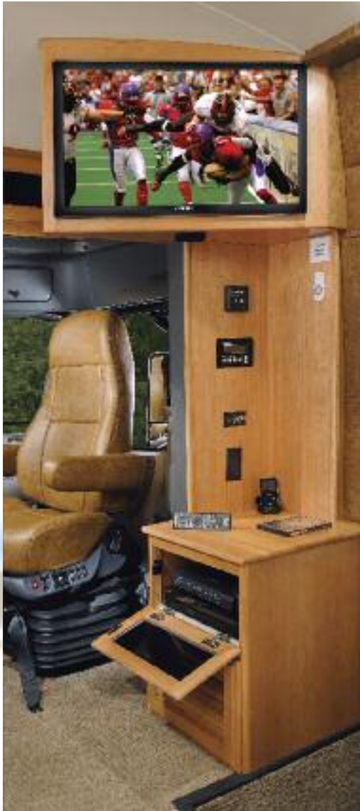
This easy to access entertainment center comes complete with a 32" LED LCD TV, Sony AM/FM/CD/Blue Ray DVD Home Theater System and a fully automatic satellite dome.

Experience a combination of masterful craftsmanship and elegant living.