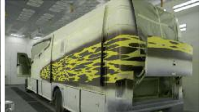
After masking to protect the previous coat, silver is applied