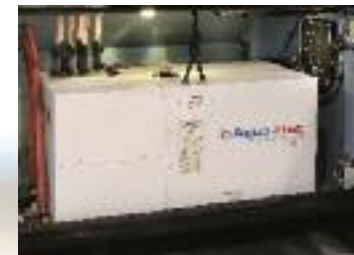
Aqua-Hot hydronic heating system