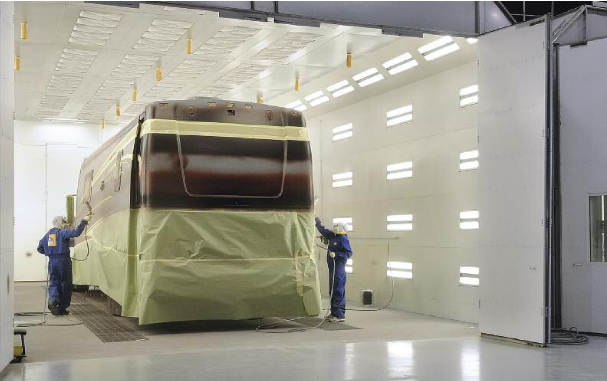
Legendary Five Step Paint - Three on-site 25' x 60' down draft bake booths can apply any custom paint scheme you can dream up.