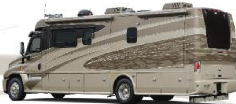
Model 370 shown in Mocha paint scheme.

Start with a solidly engineered OEM cab chassis platform and concentrate on building a cohesively engineered muscle car style coach on it. At Dynamax there are no corners to cut – only curves. Dynamax delivers with revolutionary radius curved sidewalls, eye catching paint schemes and styling that flows with the OEM body lines. The resulting product is visually appealing and structurally solid, with aerodynamic properties that improve maneuverability for a better driving experience.