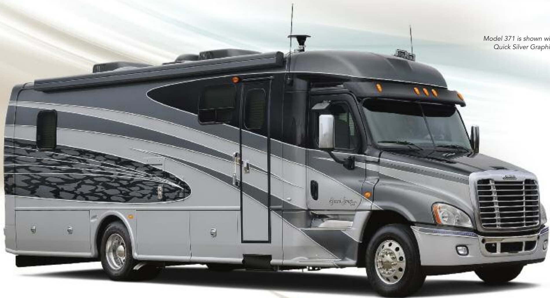
Model 371 is shown with Quick Silver Graphics