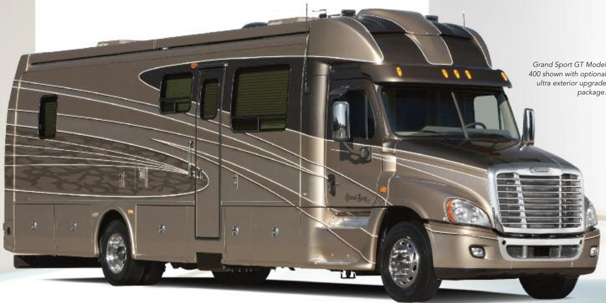
Grand Sport GT Model 400 shown with optional ultra exterior upgrade package.