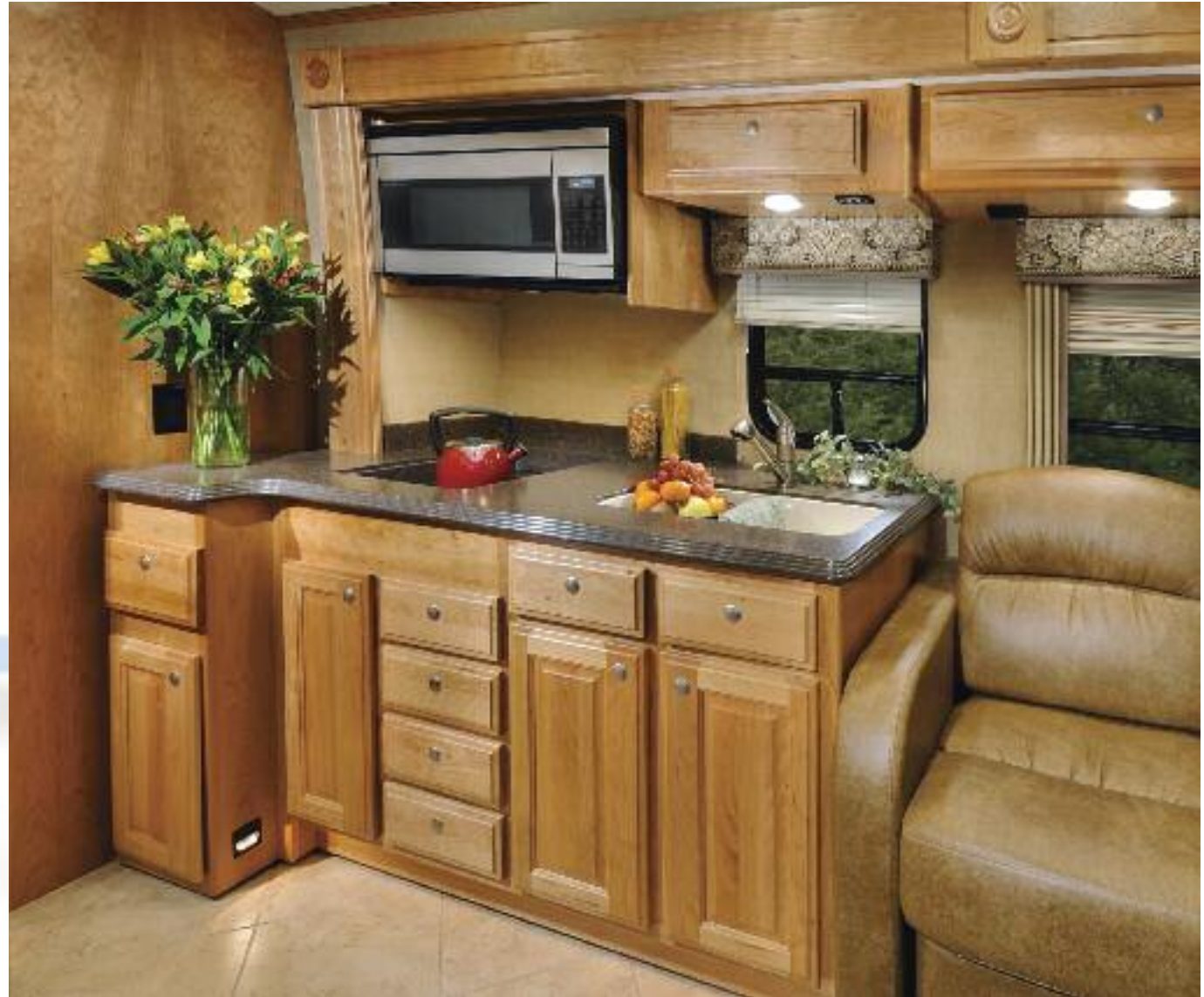
Model 370 features a convenient slide out kitchen in Cappuccino decor, with Natural Cherry hardwood cabinets, Corian® countertops, 2-burner stove top and a versatile stainless steel over the range convection microwave oven.