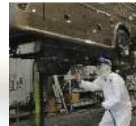
All Grand Sport GTs are undercoated

The Intellitec Multiplex Lighting System with memory is accessible from four locations throughout the Grand Sport Ultra. This convenient system allows the user to completely shut down all of the 12-Volt lighting, from ceiling to floor, by holding one button down for a few seconds. Controls are located in the overhead console cab area, entry door, bathroom (near the vanity sink), and in the bedroom overhead cabinet. The programmable scene module allows you to customize and group lighting zones for comfort, convenience, watching television, etc.