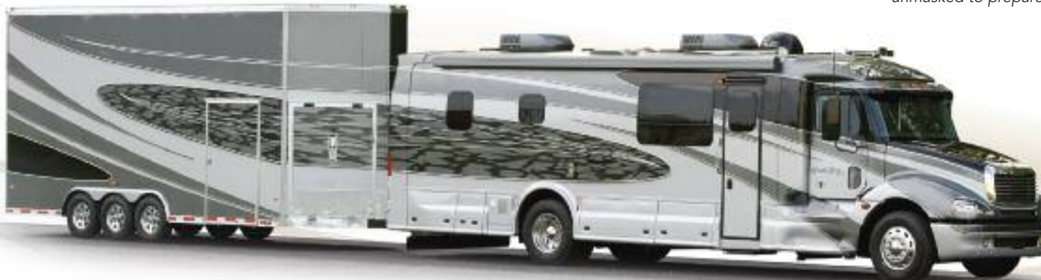
Grand Sport Shown with matching stacker trailer.