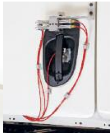
Durable, ergonomic door handles withstand the test of time.