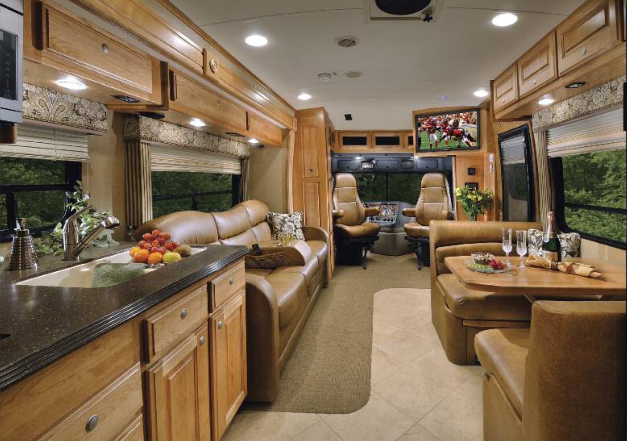
Natural Cherry hardwood cabinets, Corian® countertops, ceramic tile and ultra leather furnishings set a comfortable and luxurious tone in this Grand Sport GT Model 370. The driver and passenger seats swivel to expand seating in the living area. Cappuccino decor shown with a choice of Brissa Bark ultra leather upholstery.