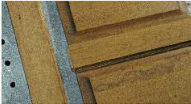
Raised panel door detail