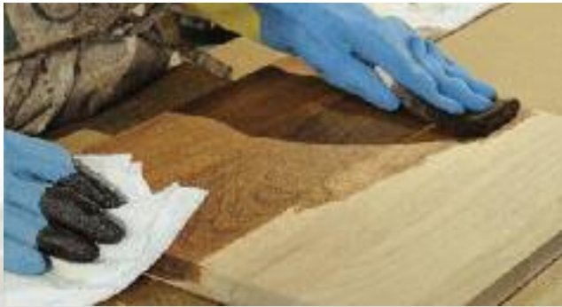
Hand rubbed finishes optimize grain definition