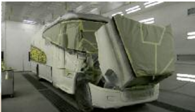
Areas are masked off to add additional colors