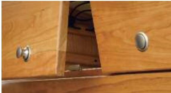
Contemporary Posi-Lock hardware secures cabinets and drawers throughout the kitchen and coach.

Each detail in the Grand Sport GT Model 371 kitchen is carefully designed to make cooking as much fun on the road as it is back home. Well planned work areas and ample solid Cherry Hardwood cabinetry set a warm inviting tone for culinary success.