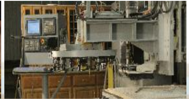
CNC routed custom Corian® countertops