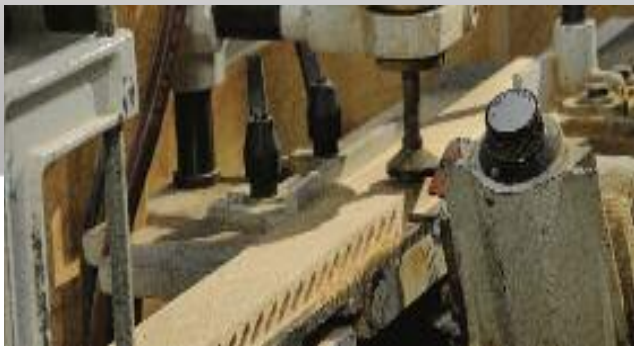
Custom louvered doors