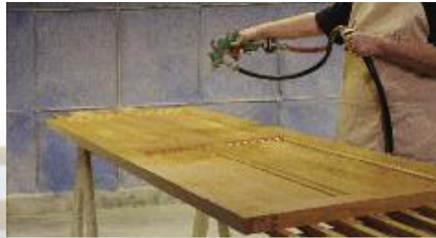
Clear coated natural hardwood doors bring out the luster