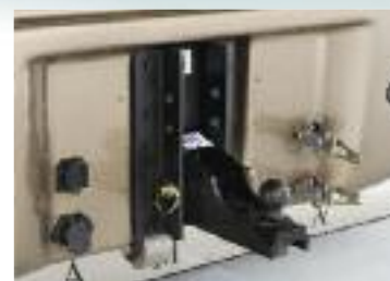
The optional 40,000 lb. rugged rear hitch helps provide you with twenty tons of towing power