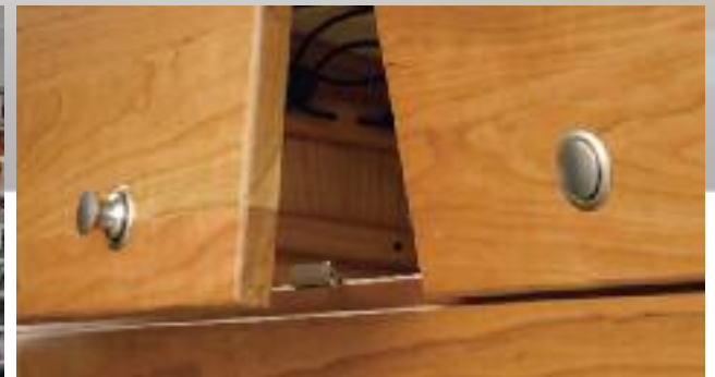
Contemporary Posi-Lock hardware secures cabinets and drawers