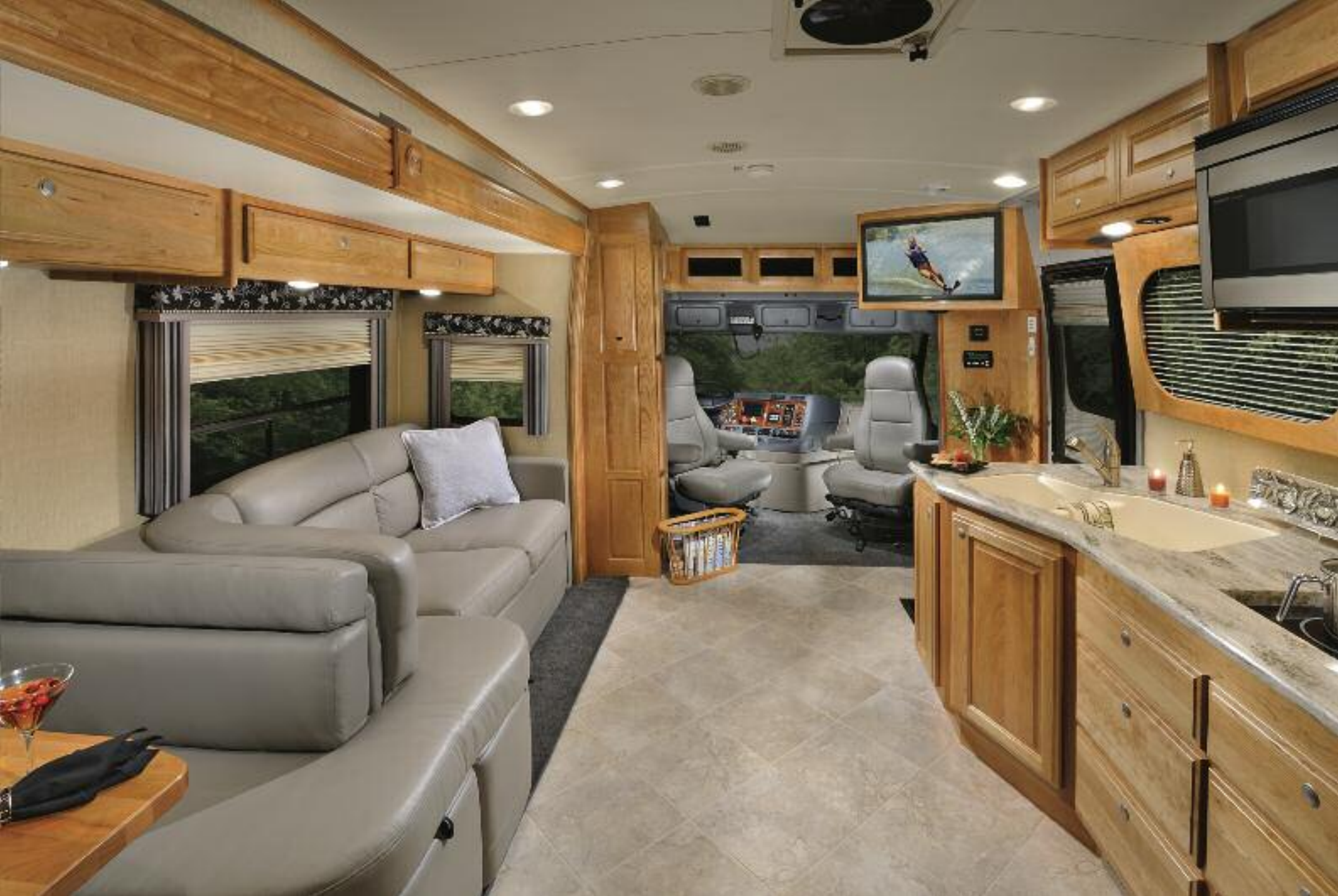
Both driver and passenger captain's chairs swivel around to face the living area, creating seating for eight people in Model 371. Grand Sport GT's level floor walkway and 7' ceiling height make it easy to access the cockpit.