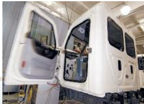
After 220,000 lock-unlock-open-and-slam cycles in engineering tests doors close just like new.