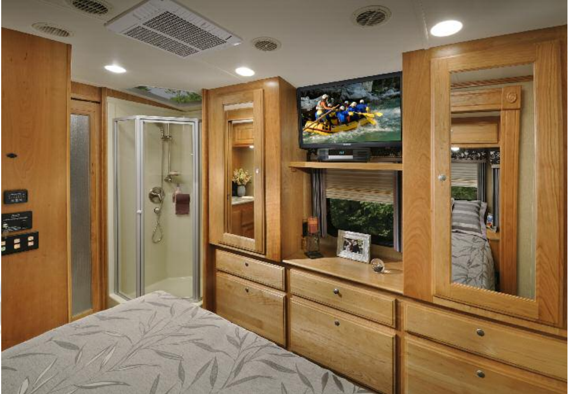
Cherry hardwood dresser drawers and twin shirt closets provide ample storage, surrounding the 32" LED LCD TV with an Integrated Bose sound system. Designer valances and day/night shades enhance this bedroom, equipped with an emergency egress window. Model 371 has a one-piece neo-angle shower and large skylight. Slate Gray decor is shown.