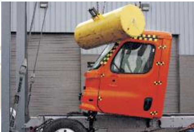
The cab design meets or exceeds stringent Swedish and European ECE R-29 crash test requirements for driver safety.