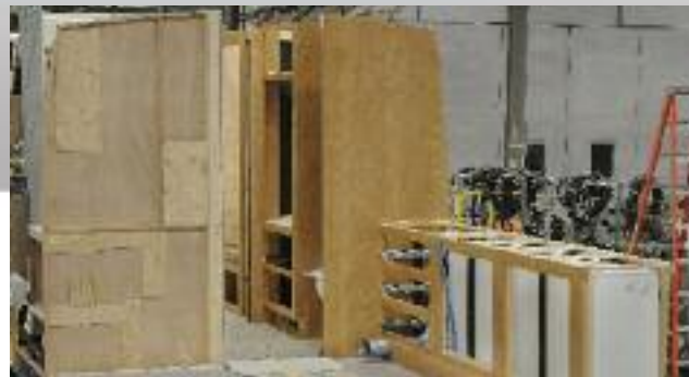
Dividing walls and cabinets are reinforced for added strength