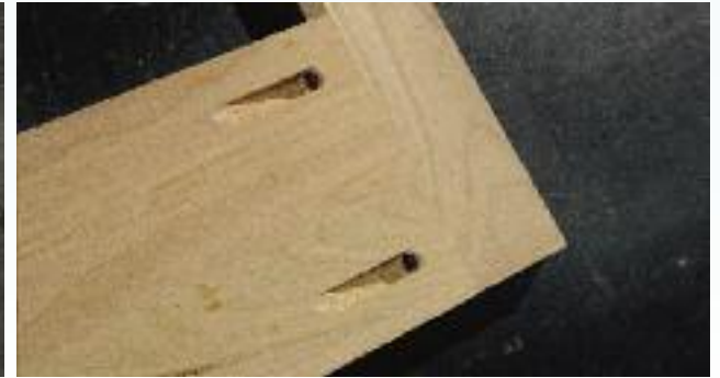
Pocket screws for structural integrity