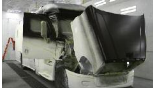
A coat of metallic black goes on