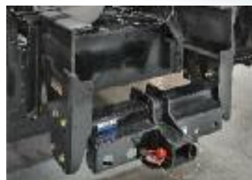
20,000 lb. hitch is standard