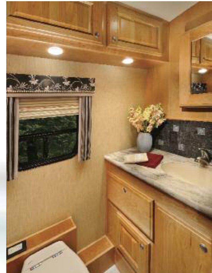
The Model 371 bathroom features a Corian® vanity countertop, with a solid surface sink, a ceramic tile backsplash and a porcelain 2-stage flush macerator toilet.