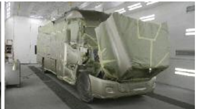
Final base coat color has been applied, unit will be unmasked to prepare for clear coat