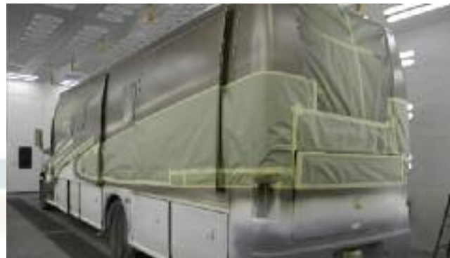
Unit is prepped and ready for final color