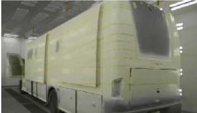
Digitally plotted, spray mask is carefully applied

Making a big statement is all in a day's work for Dynamax paint specialists. Virtually any logo, graphic or design can be digitally enlarged for precise masking and painting. This painstaking process is shown below. This prestigious 5-step paint process really shines with three coats of clear, sanded and buffed, for a distinctively polished finish.