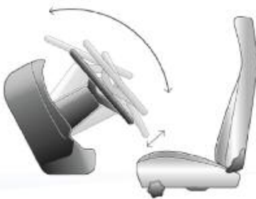
With tilt and telescoping functions, the steering wheel provides a "just right" fit every time.