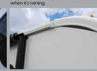
Rolled Roof Edge promotes increased water runoff from crowned roof while also providing another layer of protection where the roof meets he sidewall.