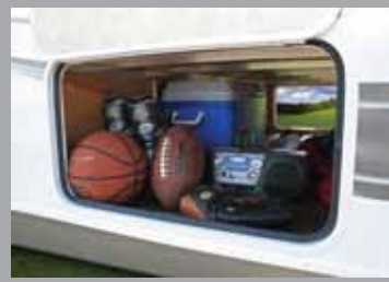
Largest Pass-Thru Storage in its class. 40.3 cubic ft. of pass-thru storage for all of your camping gear.