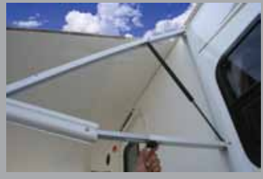
Electric Awning makes it easy to extend/ retract the awning. Awning is also equipped with adjustable arms.

Wide Stance Axles dramatically increases