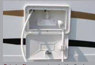
Exterior Shower equipped with a fixed shower head and access to both hot and cold water.