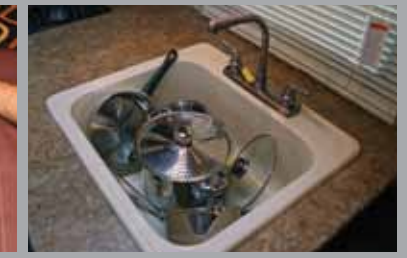
9" Deep Single Basin Kitchen Sink allows enough size and depth for washing pots and pans.