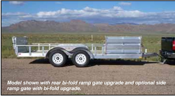
Model shown with rear bi-fold ramp gate upgrade and optional side ramp gate with bi-fold upgrade.