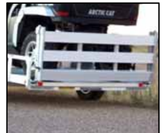
Bi-fold Ramp Gate Upgrade