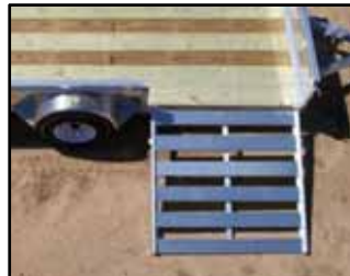
Side Ramp Gate