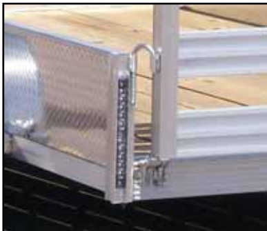
Spring Loaded J hooks Unlatch ramp with no clip removal!