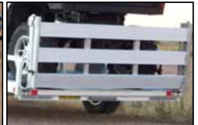
Bi-fold Ramp Gate Upgrade