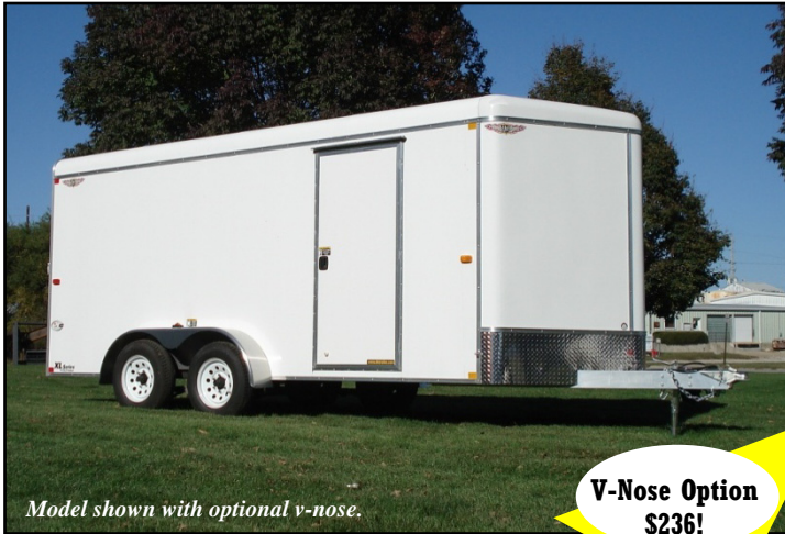
Model shown with optional v-nose.