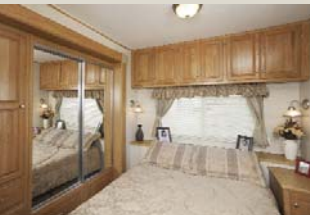
390C Bedroom Layout