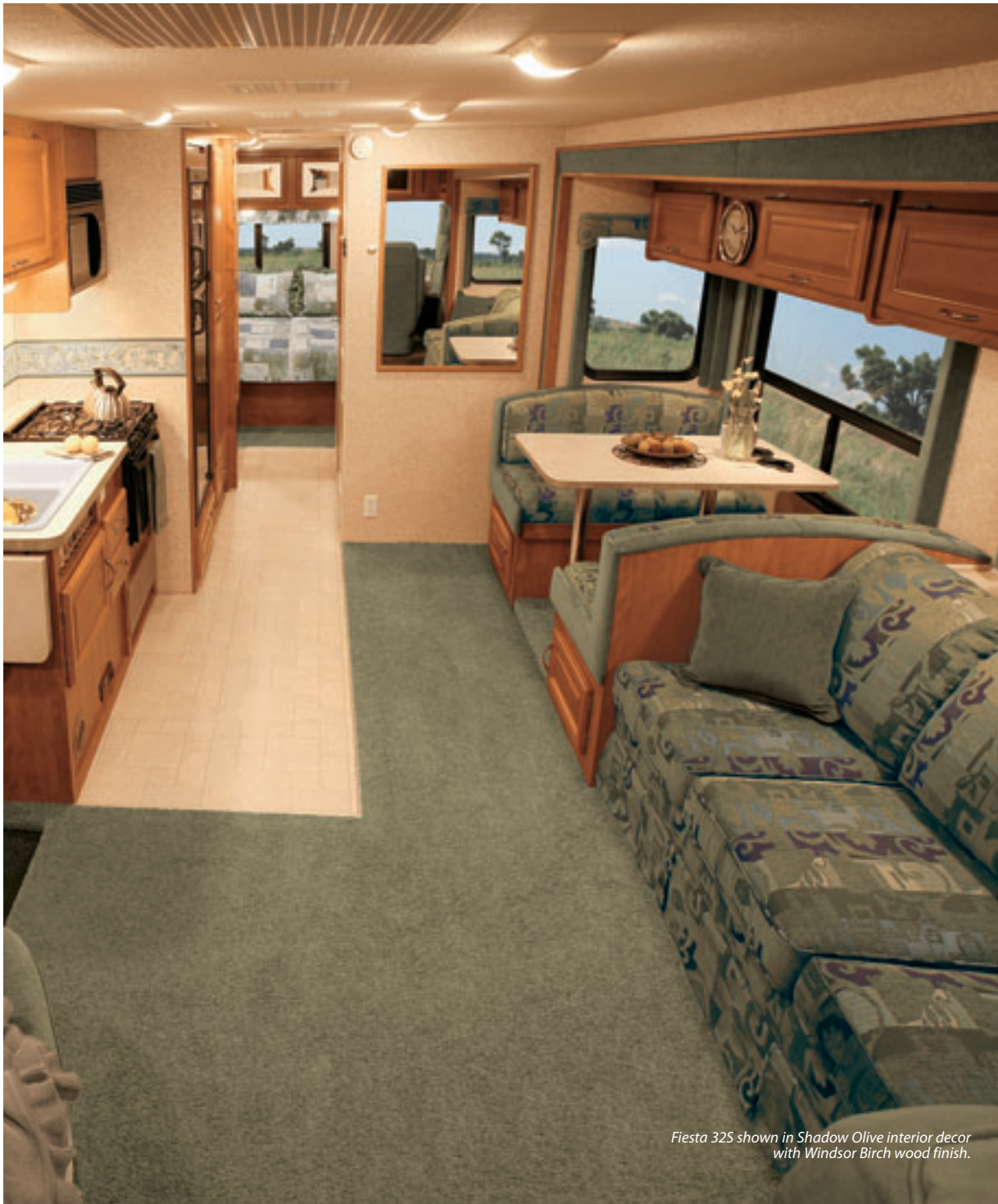
Fiesta 32S shown in Shadow Olive interior decor with Windsor Birch wood finish.

Fiesta is all about comfort thanks to inviting Flexsteel® furniture and a chill grill in the living room that dumps cool air in for those hot days. Enjoy the extra large dinette for comfortable dining as the slide-out provides a spacious living area.