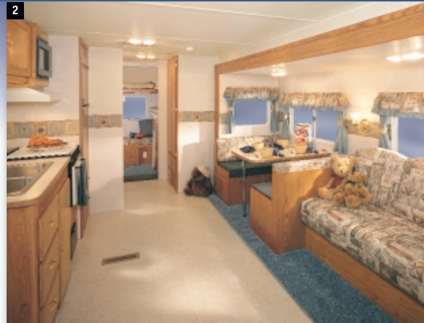
2 33 Z | Blue 01 | Interior