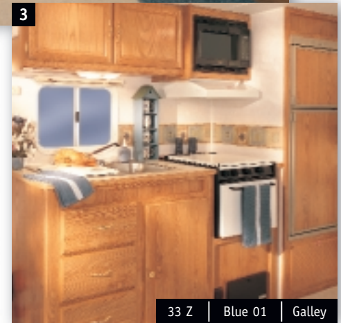
3 33 Z | Blue 01 | Galley