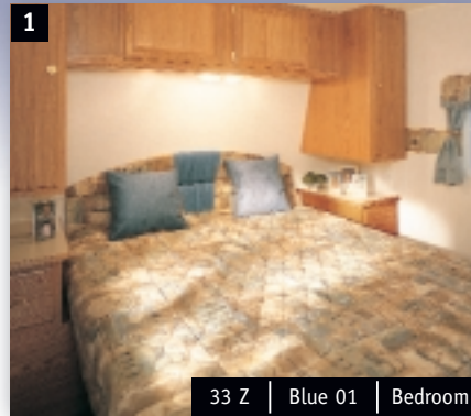
1 The custom bedspread and window treatments put the final touches on the spacious bedroom. Ample storage space, dual reading lamps and convenient nightstands enhance the beautiful wood cabinetry.