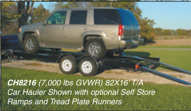
CH8216 (7,000 lbs GVWR) 82X16' T/A Car Hauler Shown with optional Self Store Ramps and Tread Plate Runners