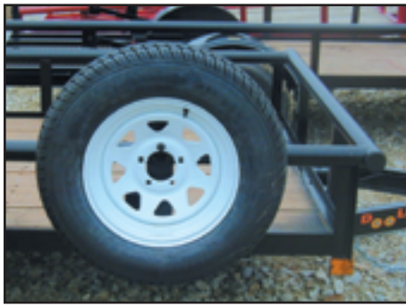
Spare Tire Mount & Tire