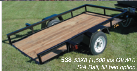
538 53X8 (1,500 lbs GVWR) S/A Rail, tilt bed option