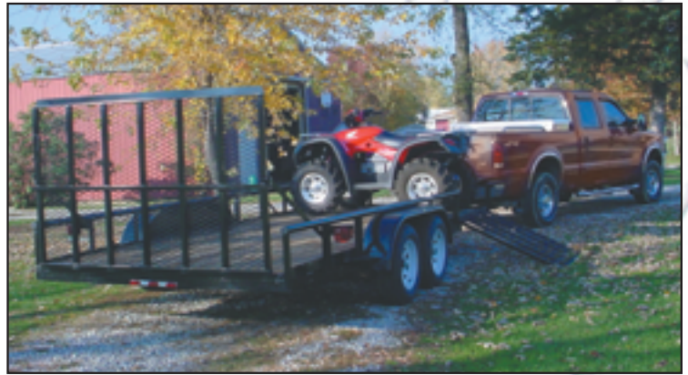
T8216 82X16' (7,000 lbs GVWR) T/A Rail shown with rear and side mesh gate, and 82" width options

Standard Equipment: 3x5x1/4" Main Beams, 5" Channel Tongue, 3-Pc, With Set Back 5000 LB Flip Up Top Crank Jack - Bolted, Electric Brake 1 Axle, 2 5/16" A-Frame Coupler, Breakaway with Battery Installed.