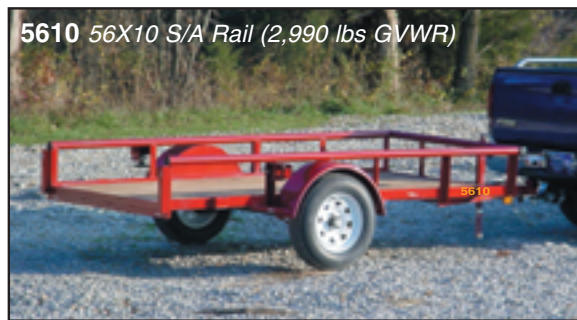
5610 56X10 S/A Rail (2,990 lbs GVWR)

Standard Equipment: 2x2 Square Tube Fabricated Tongue, Square Back Railing, Angle Iron Rail, 4 1/2" Tongue Grab Handle, 2" Coupler, 12" Tires