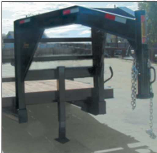
Gooseneck Optional for all Utility Trailers