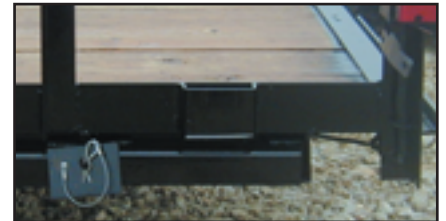
Self-store Ramps with Safety Pin