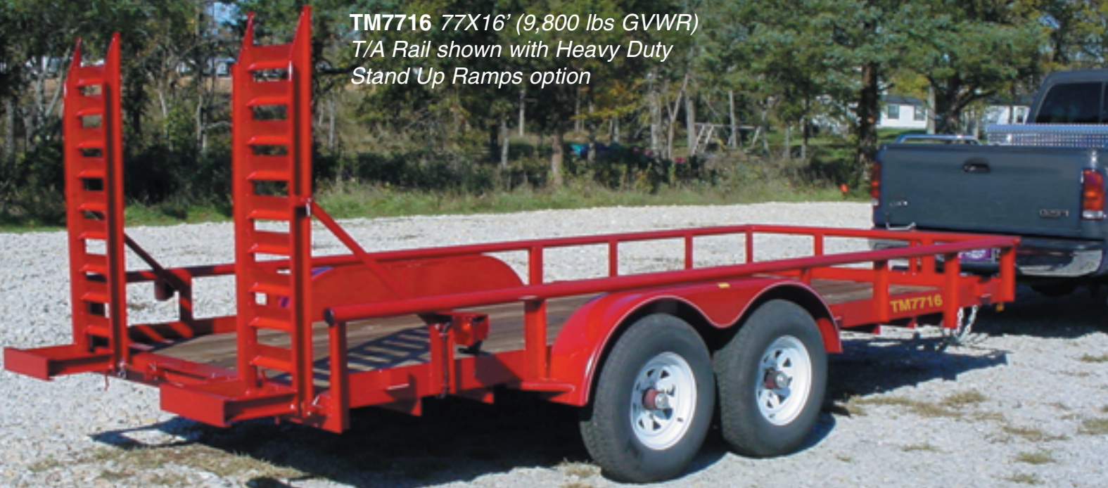
TM7716 77X16' (9,800 lbs GVWR) T/A Rail shown with Heavy Duty Stand Up Ramps option