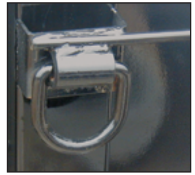
Heavy Duty D Ring