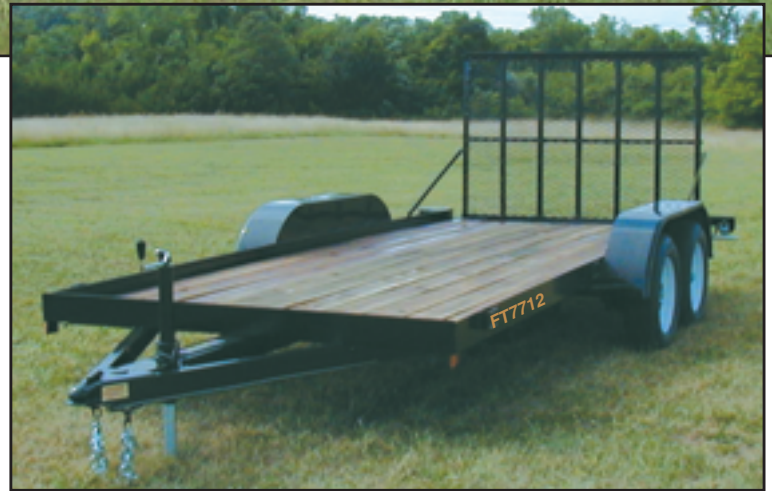
FT7712 77x12 (7,000 lbs GVWR) T/A shown with mesh gate option.

Also available in Single Axle sizes and GVWR.