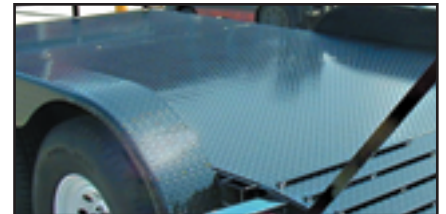
Diamond Plate Floor