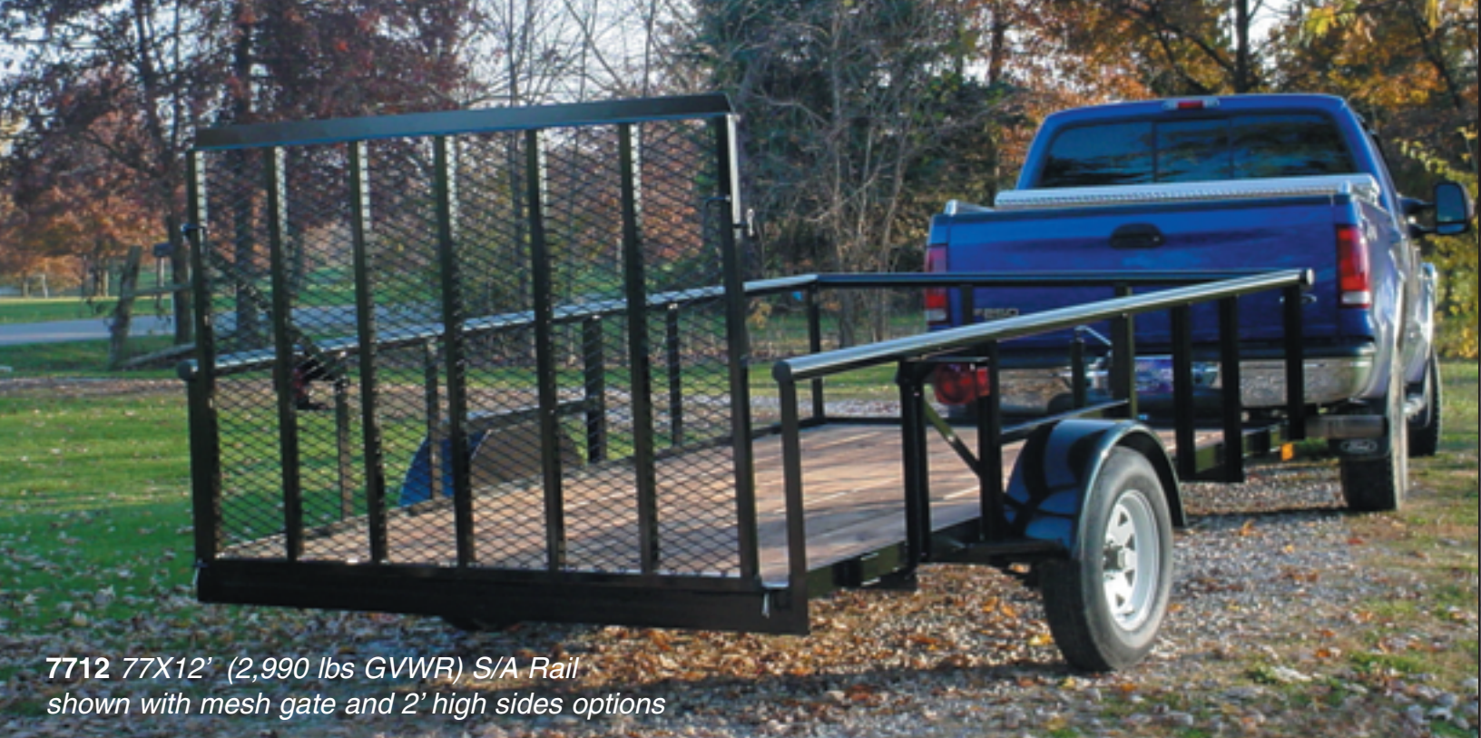
7712 77X12' (2,990 lbs GVWR) S/A Rail shown with mesh gate and 2' high sides options