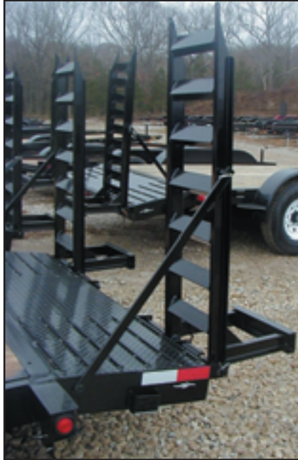
2' Dove Tail Shown with Optional Steel and Traction Bars, Heavy-duty Ramps with Spring Assist