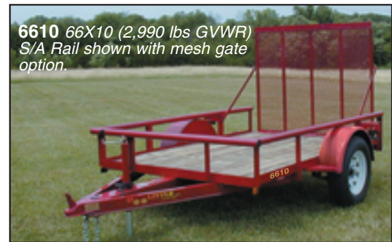
6610 66X10 (2,990 lbs GVWR) S/A Rail shown with mesh gate option.

See checklist on page 5 for available options or visit us on line at www.doolittletrailers.com for a complete list of features and options.