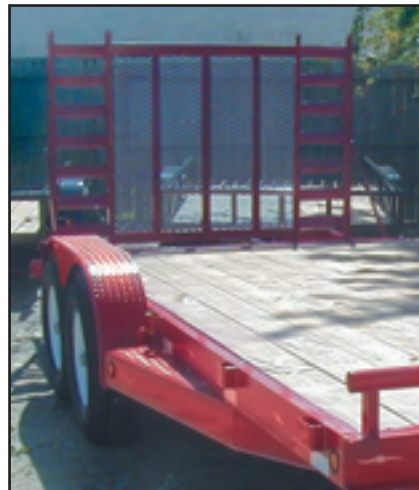
Mesh Gate, Over Heavy Duty Spring Assist Ramps