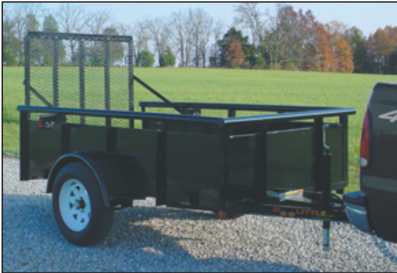
6610 66x10' (2,990 lbs GVWR) S/A Rail Shown with 2' High Steel Sides, Dropped Down 3" for Easy Tie Down, Mesh Gate options.