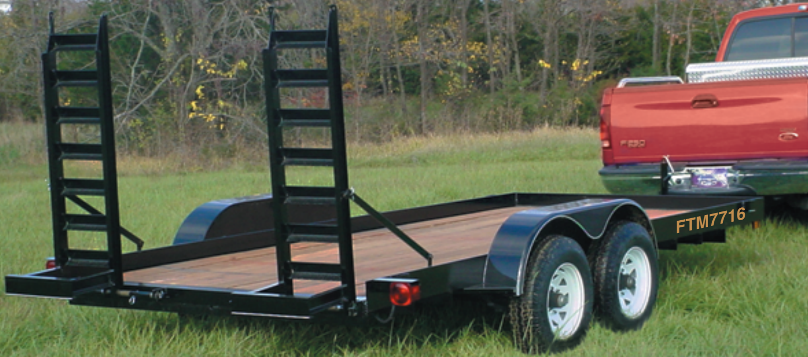
FTM7716 77x16 (9,800 lbs GVWR) T/A Flatbed Shown with Heavy Duty Adjustable Ramps option