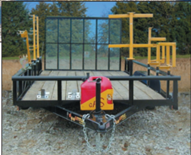
T7716 77x16 (7,000 lbs GVWR) T/A Rail Shown with Landscaping and Mesh Gate options

Whether you're hauling 4-wheelers or landscaping equipment, these rugged trailers are fully customizable and available with any of the popular add-on Doolittle features and packages.