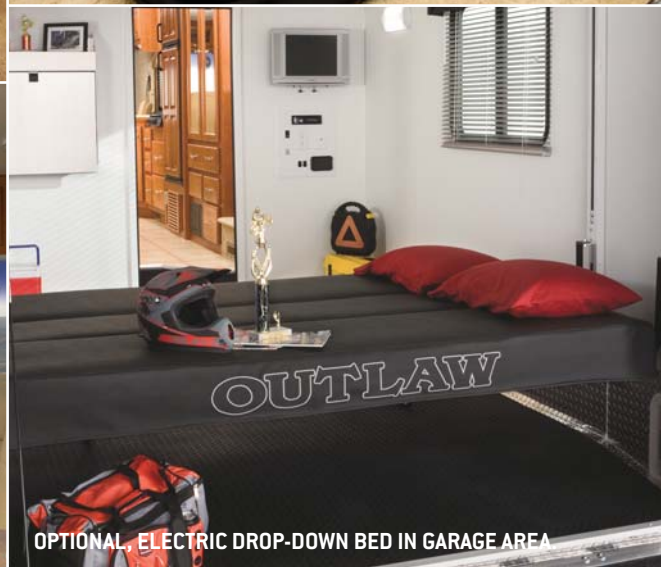
OPTIONAL, ELECTRIC DROP-DOWN BED IN GARAGE AREA