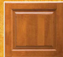
CHERRY (Standard) All interior cabinet doors feature hidden hinges.