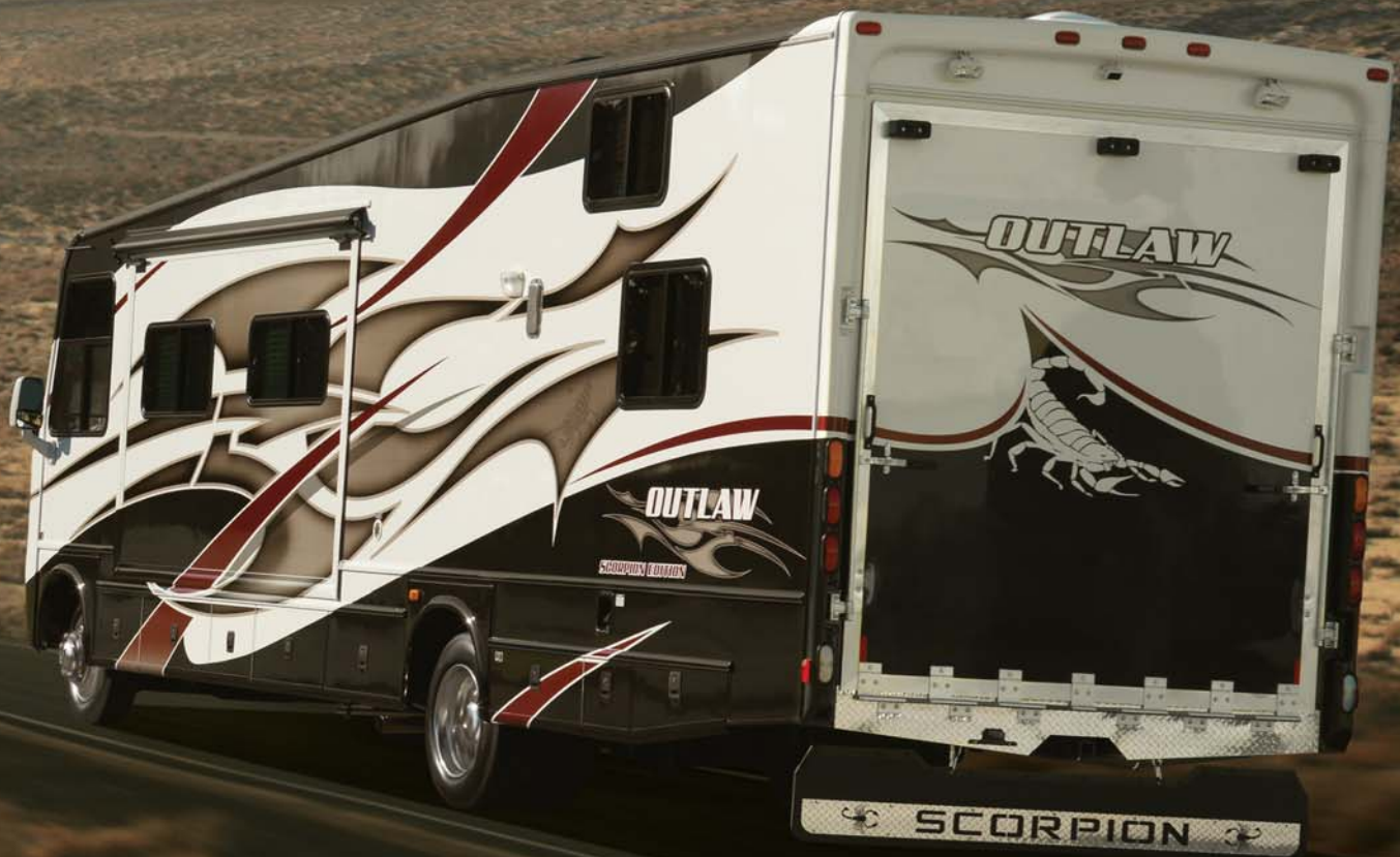
Scorpion upgrade package shown.