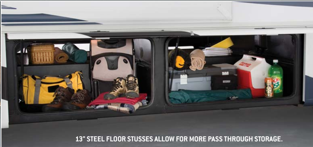
13" STEEL FLOOR STUSSES ALLOW FOR MORE PASS THROUGH STORAGE.