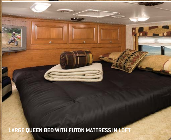
LARGE QUEEN BED WITH FUTON MATTRESS IN LOFT.