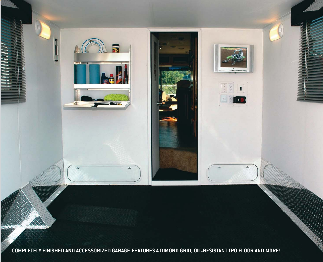
COMPLETELY FINISHED AND ACCESSORIZED GARAGE FEATURES A DIMOND GRID, OIL-RESISTANT TPO FLOOR AND MORE!

In the garage, you'll find a 15" LCD TV (Opt.) along with a stainless storage cabinet, tie downs, premium sound system and more!