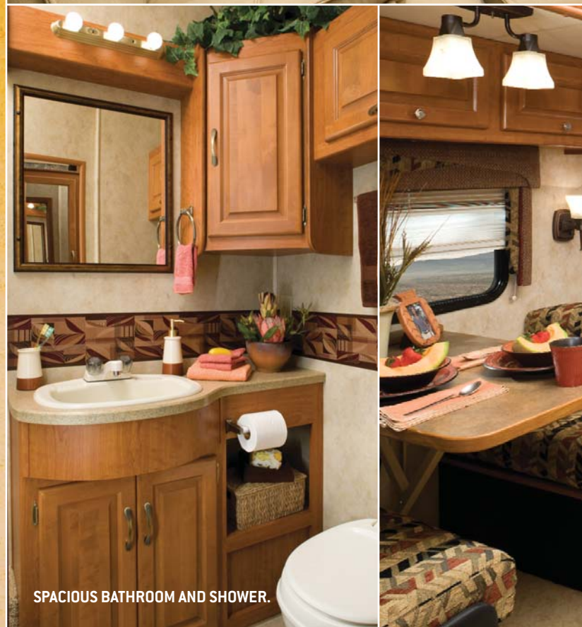
SPACIOUS BATHROOM AND SHOWER.