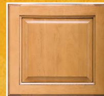
GLAZED MAPLE (Optional) Solid wood raised panel door and drawer fronts.