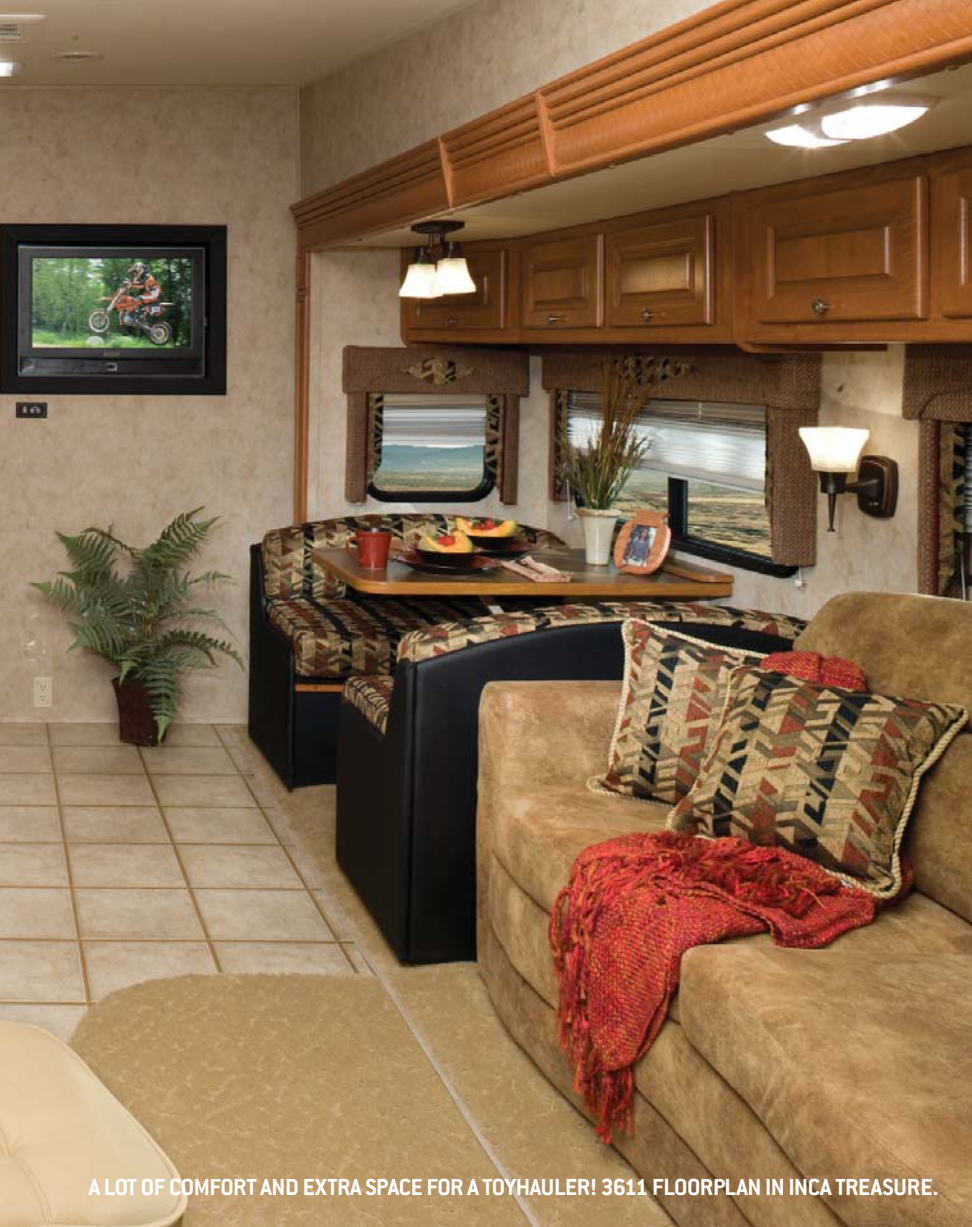
A LOT OF COMFORT AND EXTRA SPACE FOR A TOYHAULER! 3611 FLOORPLAN IN INCA TREASURE.