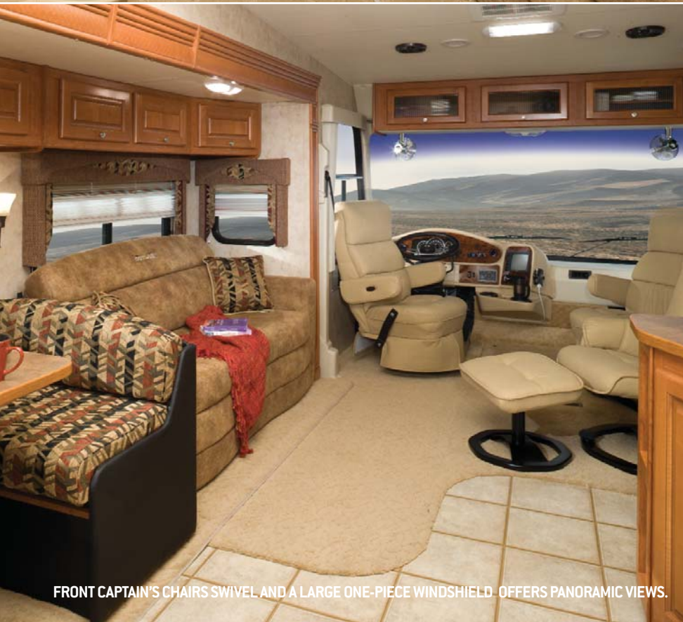
FRONT CAPTAIN'S CHAIRS SWIVEL AND A LARGE ONE-PIECE WINDSHIELD OFFERS PANORAMIC VIEWS.