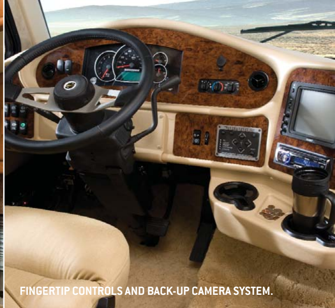
FINGERTIP CONTROLS AND BACK-UP CAMERA SYSTEM.