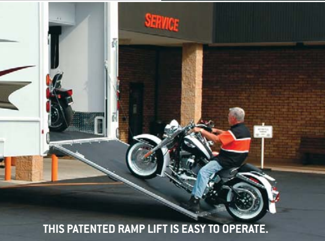
THIS PATENTED RAMP LIFT IS EASY TO OPERATE.