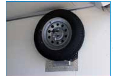
▪ Optional Wall-Mounted Spare Silver Mod Tire