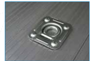
Recessed Heavy Duty D-Rings

*Shown w/ Optional Aluminum Wheels & Two-Tone Exterior