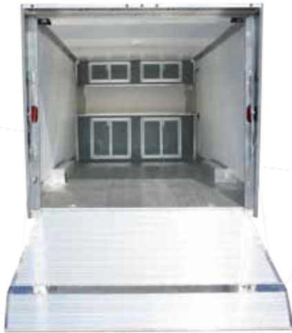
Optional Cabinet Package Shown