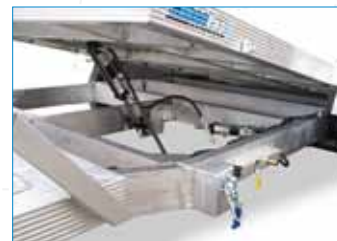
▪ Hydraulic Tilt System w/ Control Valve