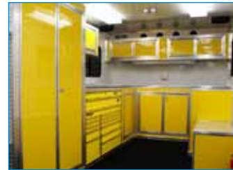
▪ Custom Cabinet Package

*Shown w/ Optional Aluminum Wheels, Extra Height, Flat Nose Construction, Ladder Rack & Ladder