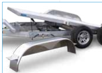
▪ Driver's Side Removable Fender