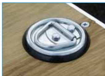
• Surface-Mounted D-Rings