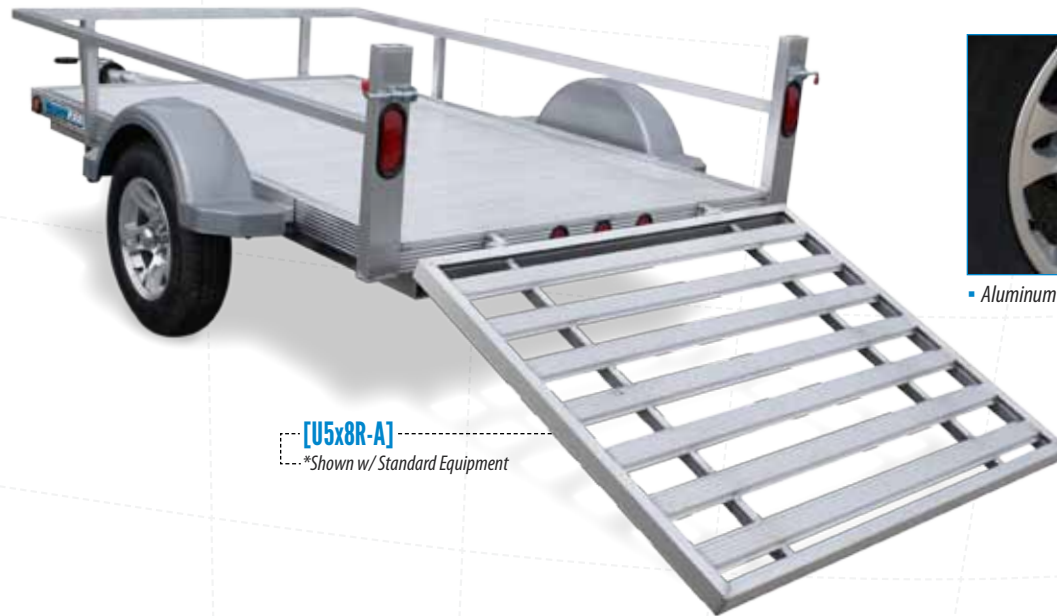
[U5x8R-A] *Shown w/ Standard Equipment