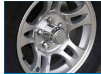
• Aluminum Spoke Wheels (Optional on R-W)