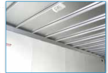
▪ Optional White Luan Interior Walls w/ Trim