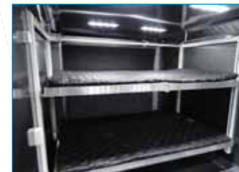
▪ Happy Jac Bunk Bens