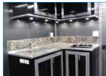
▪ Kitchen Sink & 2-Burner Range

Deluxe Bathroom Package Stainless Steel Kitchen Sink 5.0 Cubic Foot Refrigerator 110V Microwave Fold-Away Bunk Beds Extra Fold-Away Sofa/Sleeper Combo Extra Fold-Away Dinette/Sleeper Combo HappiJac Power Lift Queen Bed Wall-Mounted LCD TV/DVD Player Combo Caster Wheels 16" Motion-Sensored LED Dome Light