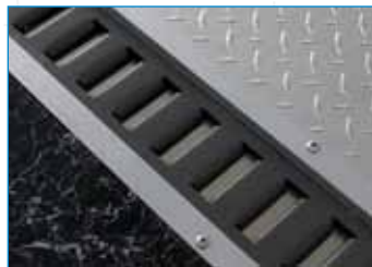
▪ Recessed E-Track