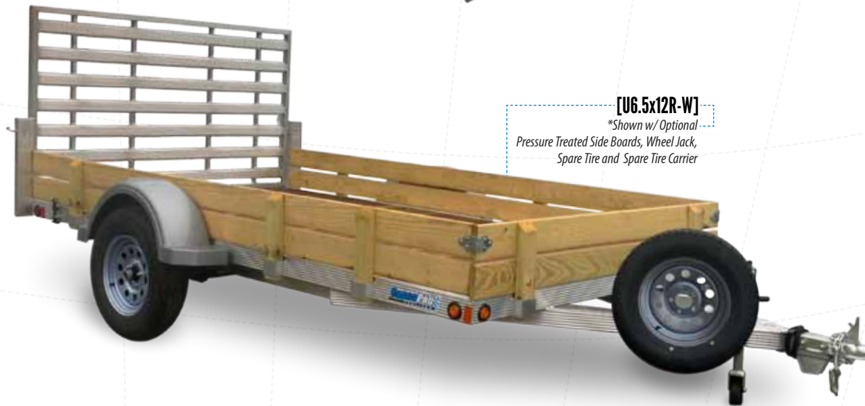
[U6.5x12R-W] *Shown w/ Optional Pressure Treated Side Boards, Wheel Jack, Spare Tire and Spare Tire Carrier