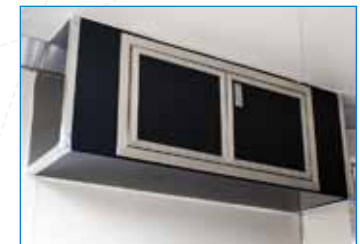
▪ Deluxe Overhead Cabinet

*Shown w/ Optional Radius Roof, RV-Style Door, Pull-Out Step, E-Track, Diamond Plate Transitional Flap, Exterior Flood Lights, Awning