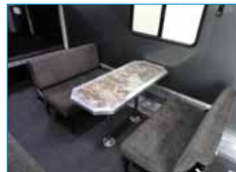
▪ Folding Dinette