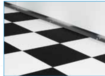
▪ Checkerboard Flooring