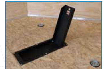
▪ Flip-Up Motorcycle Wheel Chock