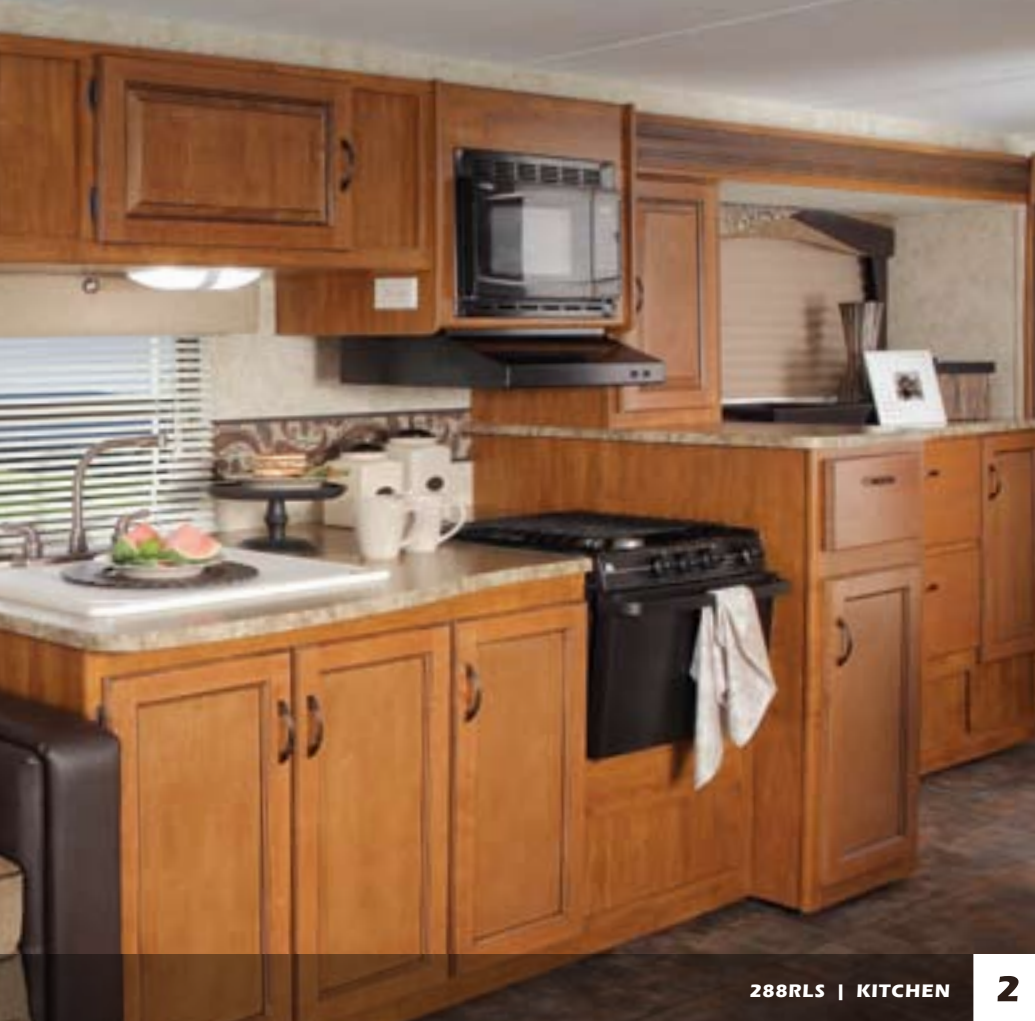
288RLS | KITCHEN