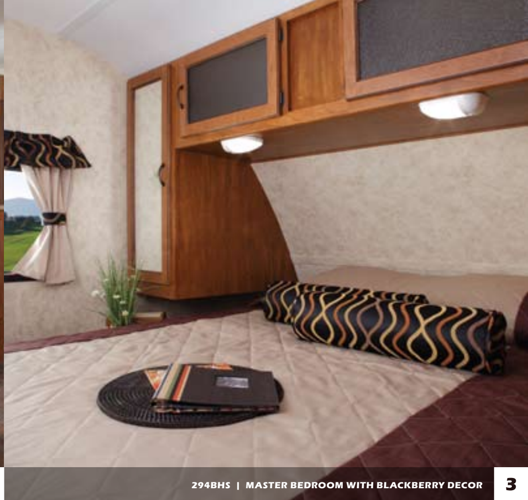
294BHS | MASTER BEDROOM WITH BLACKBERRY DECOR