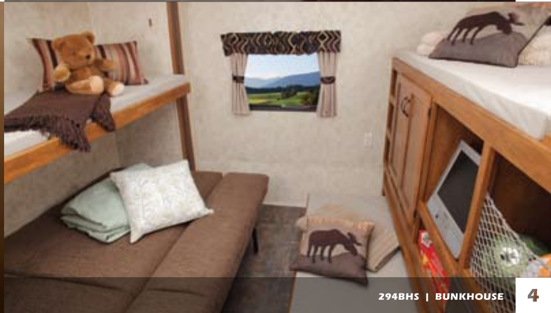
294BHS | BUNKHOUSE

The bunkroom in the 294BHS is the ultimate kids hangout. During the day they will love playing in all the space provided and at night the oversized rollover sofa, bunk beds and trundle bed makes sleeping 4-6 kids a breeze.