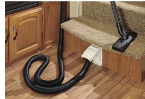
The built-in central vacuum system makes clean up a breeze.