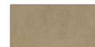
Optional Soft Touch Elantra Leather (includes sofa and dinette chairs)