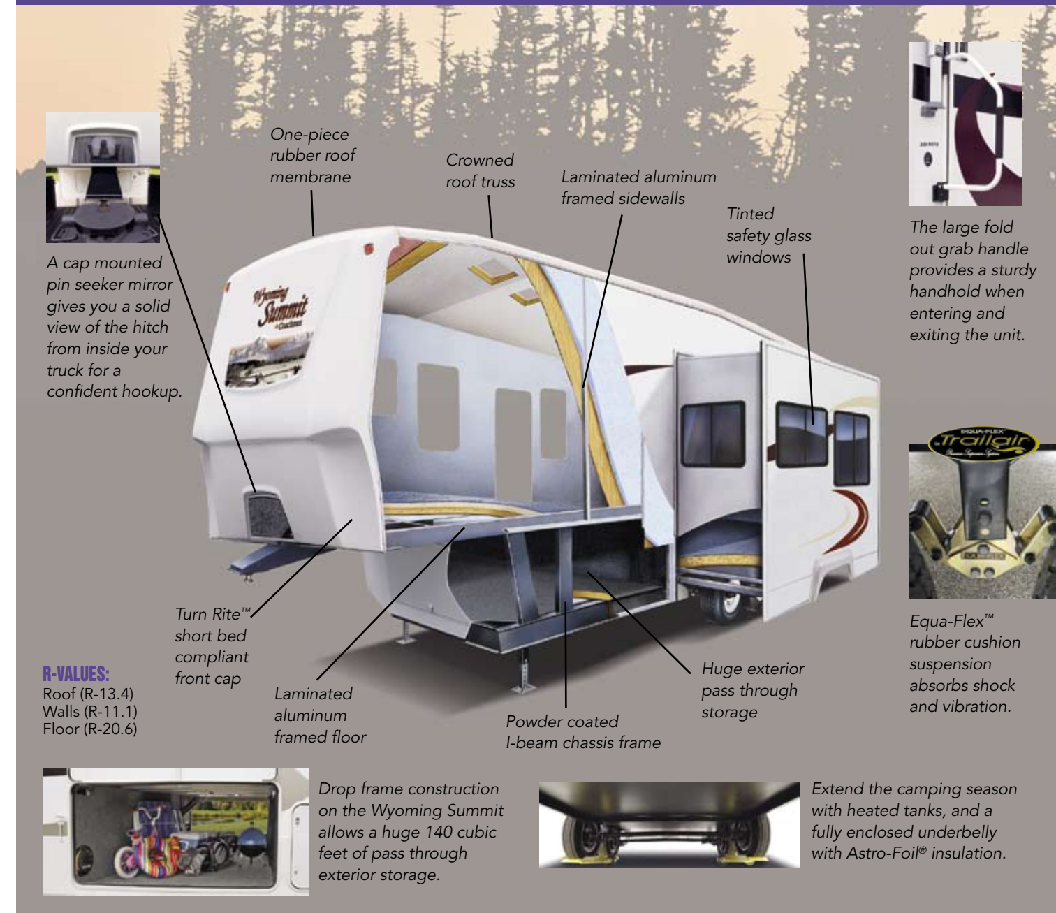
A cap mounted pin seeker mirror gives you a solid view of the hitch from inside your truck for a confident hookup.