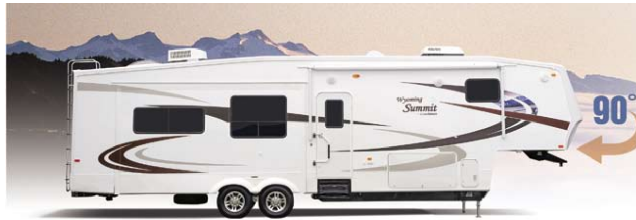
Wyoming Summit's notched front cap design allows up to a 90° turning radius on most shorter bed pickup trucks, for added maneuverability.

Expand your horizons. Why not visit the places you've always wanted to see in comfort and style? Wyoming Summit lets you explore your world in a big way. With so much luxury and living space, you'll want to go as far as your dreams take you. And when you return home, you'll be planning the next grand adventure.