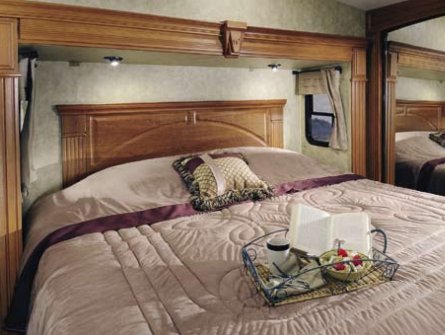
Relax and refresh in Wyoming Summit's lavishly styled bedroom complete with directional lighting, large mirrored closets and plenty of wardrobe storage. King bed with pillow top mattress is standard.