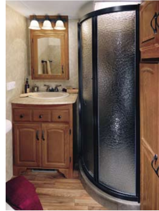
Wyoming Summit's spacious bathroom includes a large radius shower with a residential vanity area.