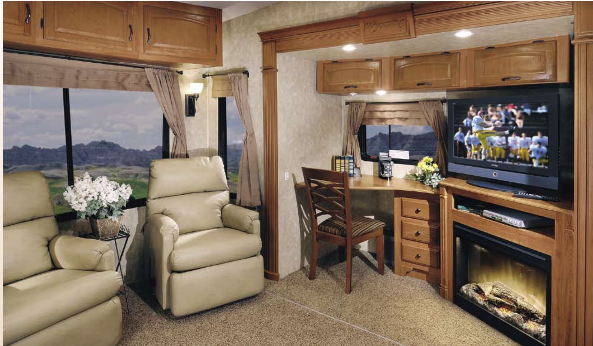
Everyone can spread out and relax in Wyoming Summit's ample living room featuring soft touch recliners, an optional fireplace, a convenient desk, and a huge 32" LCD TV!