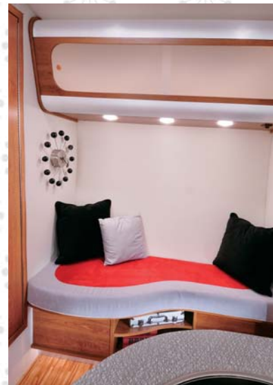
Shasta's comfy lounge/storage bay features overhead reading lamps and a retro wall clock.