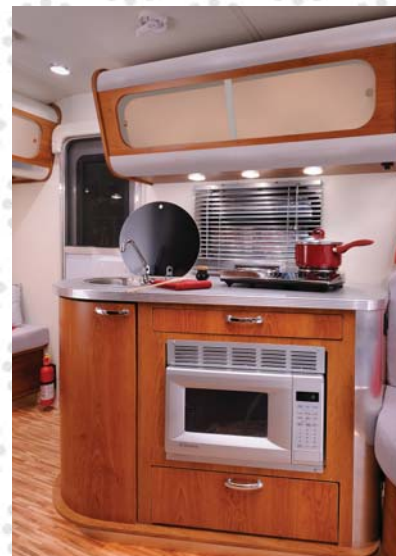
The kitchenette features a stylish hot plate, stainless steel sink and microwave and chrome-edged laminate countertop.