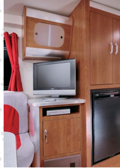
Shasta Airflyte™ is equipped with a 19" LCD Television and a DVD player.