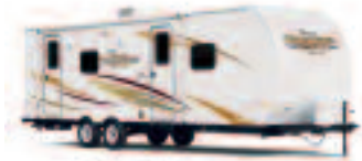
Captiva Ultra-Light Travel Trailers