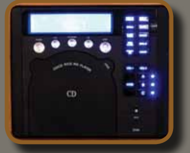
AM/FM, CD Radio with Speakers and IPOD Docking Port