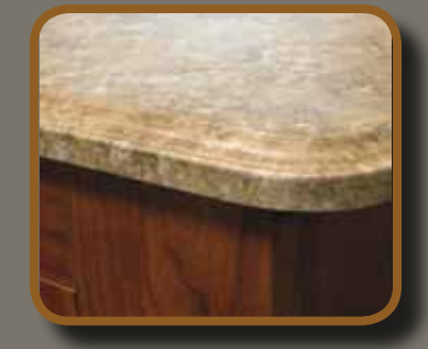
Thermo-Foil Countertops NOT T-mold Edge