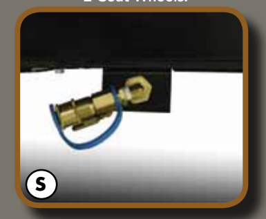
Exterior LP Quick-Connect Valve for adding a Outside Grill and other Propane Accessories to your Catalina