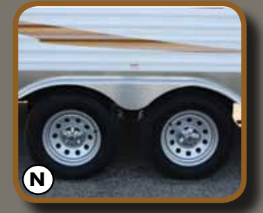
Superlube™ Axles with Radial Tires, polished aluminum fender skirts and E-Coat Wheels.