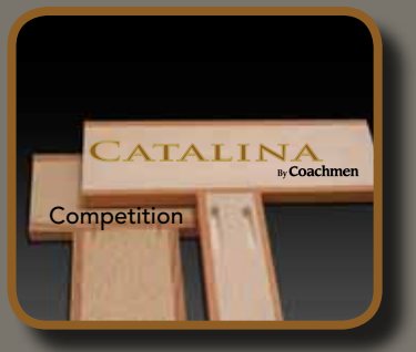
Screwed Cabinet Fascia NOT Stapled like most brands (MORE Strength)