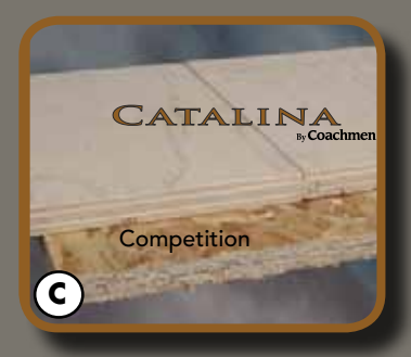
5/8" Tongue and Groove Flooring NOT OSB Flooring (EXTRA Strength)