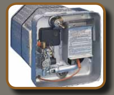
6 Gal. DSI Remote Operated Water Heater (Fire up your Water Heater from Inside your Catalina)