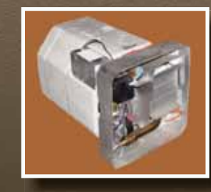
6 Gallon Direct Spark Ignition Water Heater