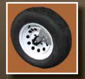
EZ Lube Axles with Radial Tires