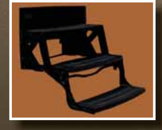
Radius Entry Steps